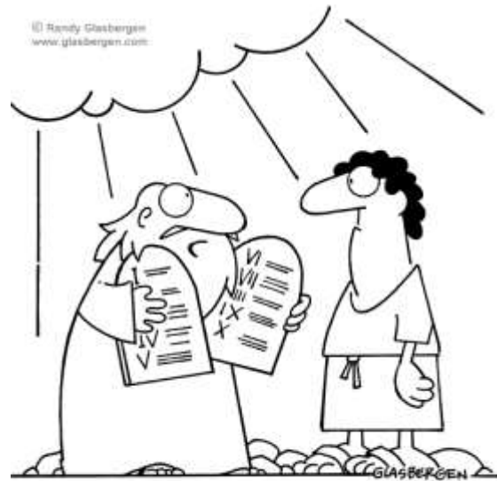
"I downloaded them from a cloud."

Stewardship is....Everything we think, say and do after we say "I Believe"