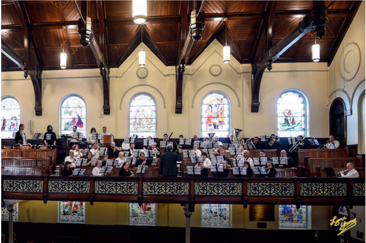
On October 29, we celebrated the 50th Anniversary of the Gower Community Band in Worship