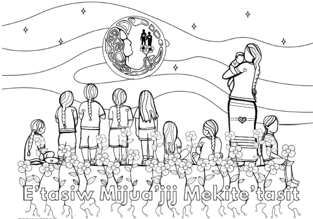
More coloring pages at www.urbaninkwenu.com/coloring-pages

I am honoured to be able to tell my story so that others may benefit and understand, and maybe other survivors will feel comfortable enough to share their stories.